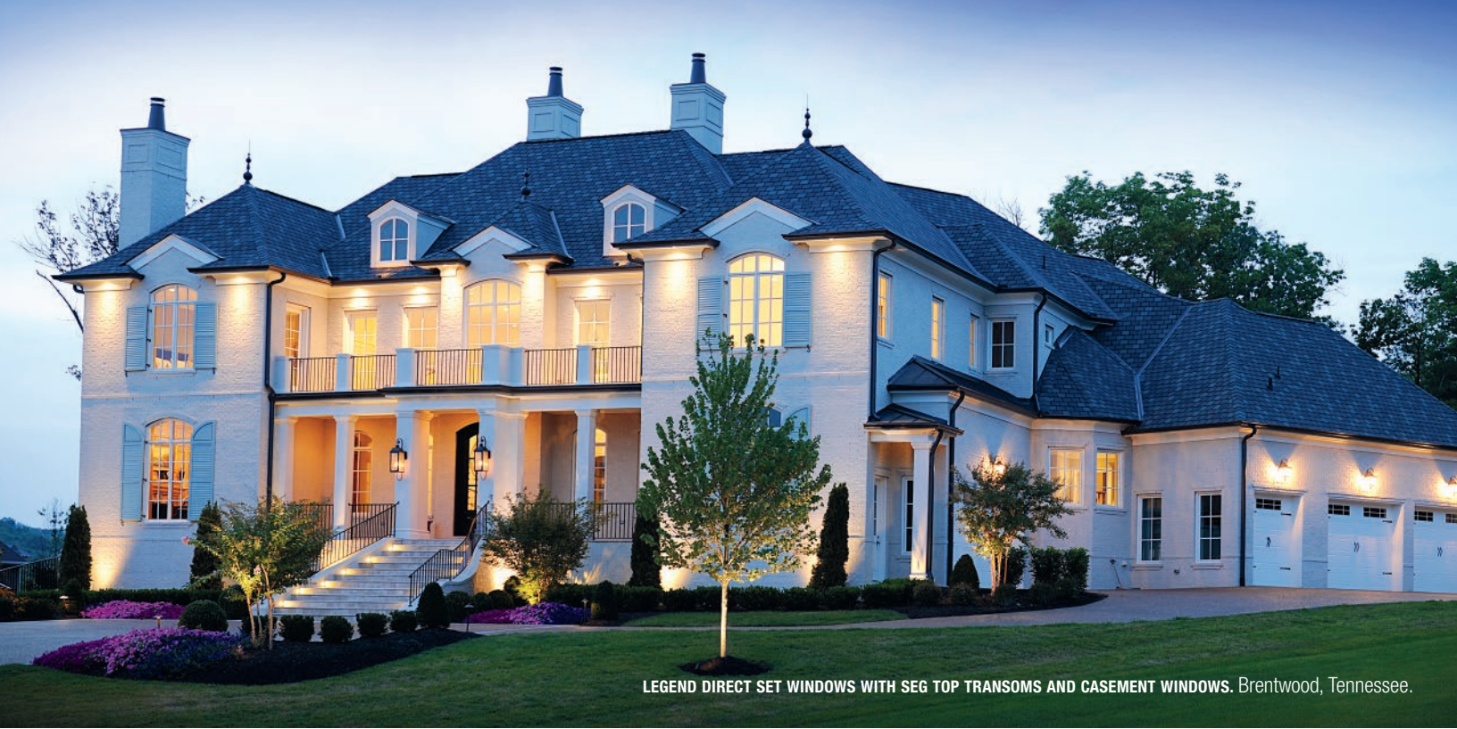
LEGEND DIRECT SET WINDOWS WITH SEG TOP TRANSOMS AND CASEMENT WINDOWS. Brentwood, Tennessee.