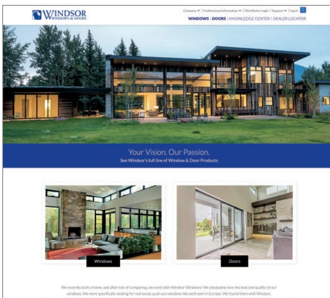
Corporate Site www.windsorwindows.com

Windsor products are sold by select dealers across the United States, Mexico and Canada. Visit a dealer for a personalized demonstration of windows and doors and see for yourself how Windsor can be your answer for quality products and passionate service.