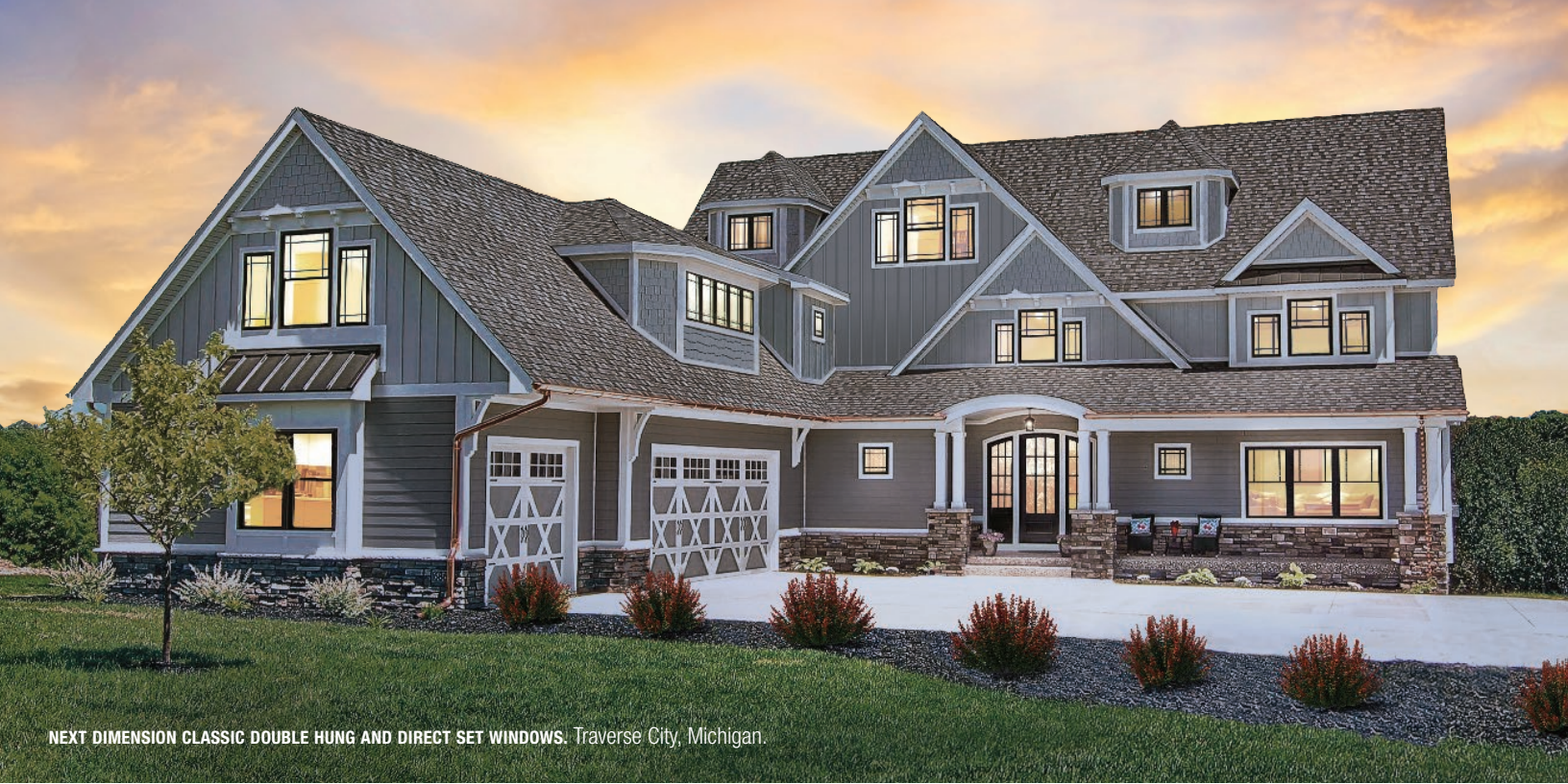
NEXT DIMENSION CLASSIC DOUBLE HUNG AND DIRECT SET WINDOWS. Traverse City, Michigan.