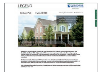
Legend microsite www.windsorlegend.com