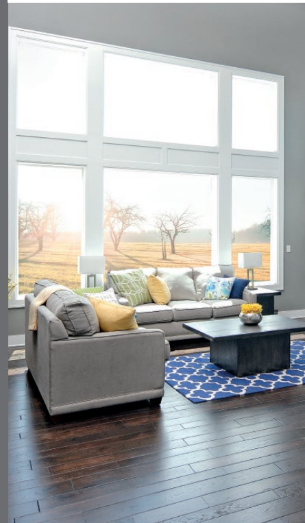
FEATURED ABOVE // NEXT DIMENSION SIGNATURE PICTURE WINDOWS. Ankeny, Iowa.