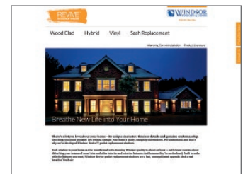
Revive microsite www.windsorrevive.com