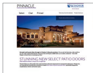
Pinnacle microsite www.windsorpinnacle.com