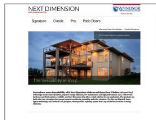
Next Dimension microsite www.windsornextdimension.com