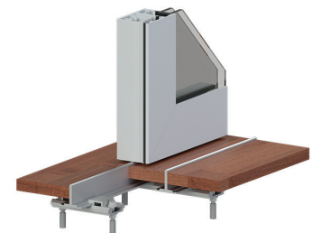
Multi-slide 2-1/2" recessed sill no drainage