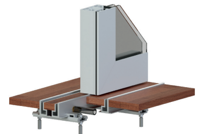
Multi-slide 2-1/2" recessed sill with drainage