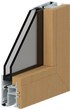
Multi-slide Alum Ext. Wood Int. Panel